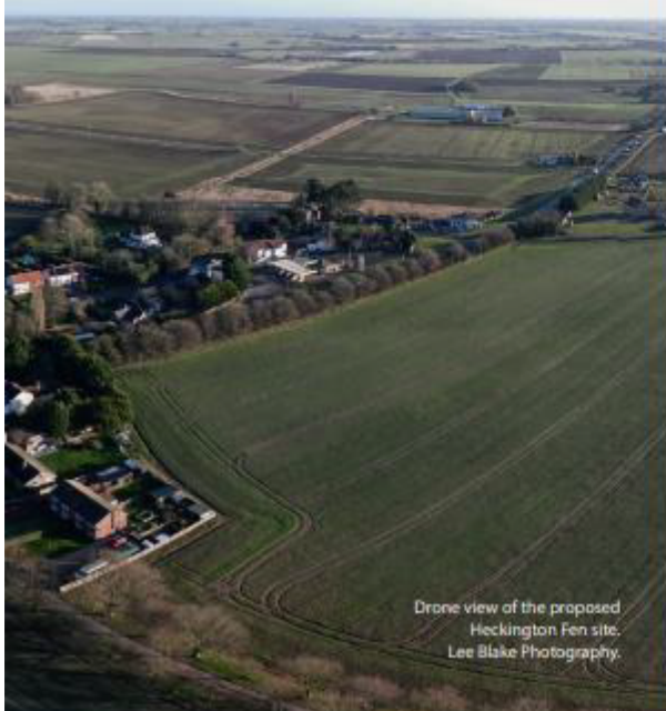
Drone view of the proposed Heckington Fen site.

A final decision on the Heckington Fen Solar Park could be made by mid-2024 and, subject to the grid connection date, construction could start soon afterwards and is expected to take some 12-18 months. The site could be operational as early as 2026.