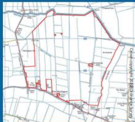
Location plan with annotated outline of site marked in red.

More information about the plans, as well as how you can give your views, can be found on the project